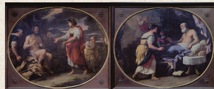
Job comforted by his family

In the priest's vestry, there are two paintings attributed to Luca Giordano (1634-1705)